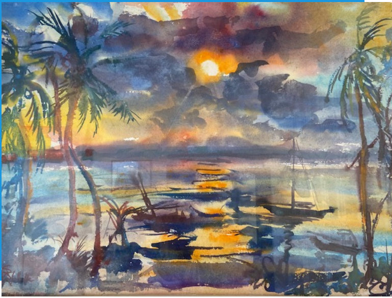
Sunrise on Lamu